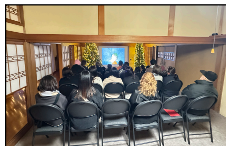
Above: Christmas Events