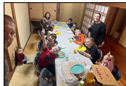
Above: Kid's event at new building Below: Chocolate Making for Valentine's Event